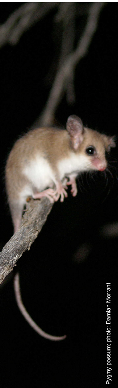
Pygmy possum; photo: Damian Marrant