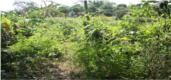
Figure 3 Excessive vegetation and trees on both the upstream and downstream slopes