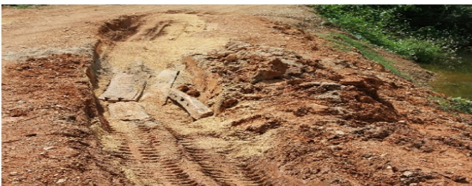
Figure 4 Severe traffic damage on the crest