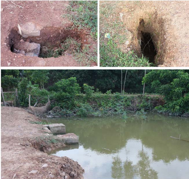
Figure 6 Piping failures resulting from construction or material defects and inappropriately designed spillway