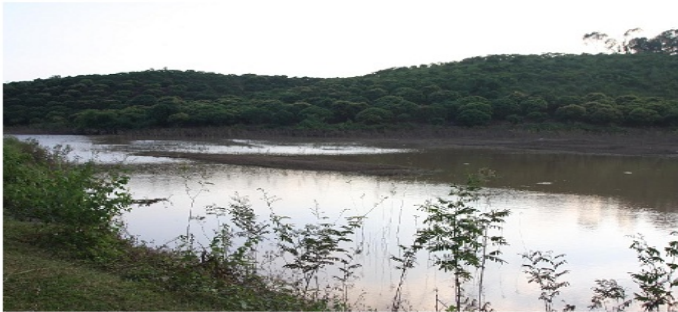
Figure 5 Inability to store design water capacity because of leakage