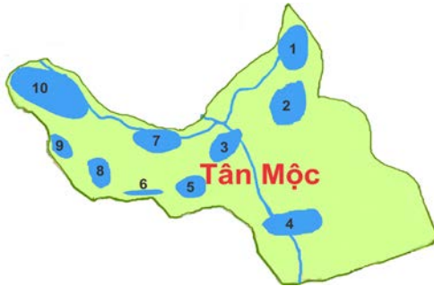
Figure 1 Ten sample dams that were conducted in on-site surveys

All dams for on-site surveys were selected in Luc Ngan district, Bac Giang province about 50 km from Ha Noi - the capital city of Vietnam. Luc Ngan district is located between 21015' - 21035'N and 106033' - 106052'E in the northeast of Bac Giang province in Vietnam (DWIM 2006). The district covers an area of 1,012.2 km 2 and its population in 2004 was 196,516 (Figure 2).