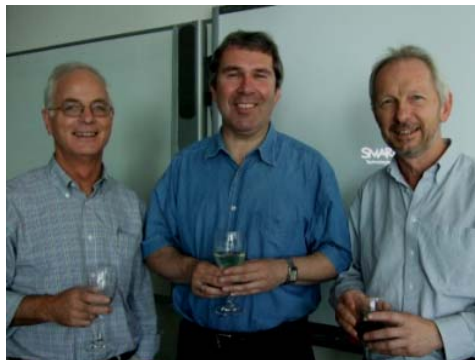
Several photos taken at the CREEW seminar on 27th March