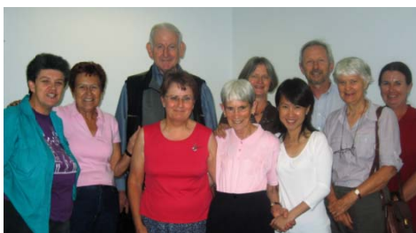
Students and Staff