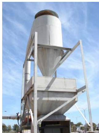
Photograph 16. Dust Extraction unit