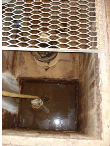
Photograph 18. - Sump