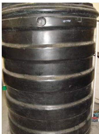
Photograph 21. – Black Poly Rain water Tank