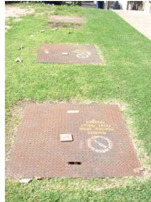
Photograph 2 – 3 Steel Plate Covers to access hatches