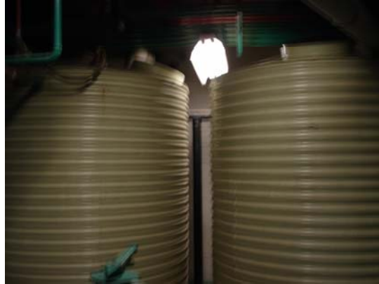
Photograph 19 - 2 Poly Rain Water Tanks