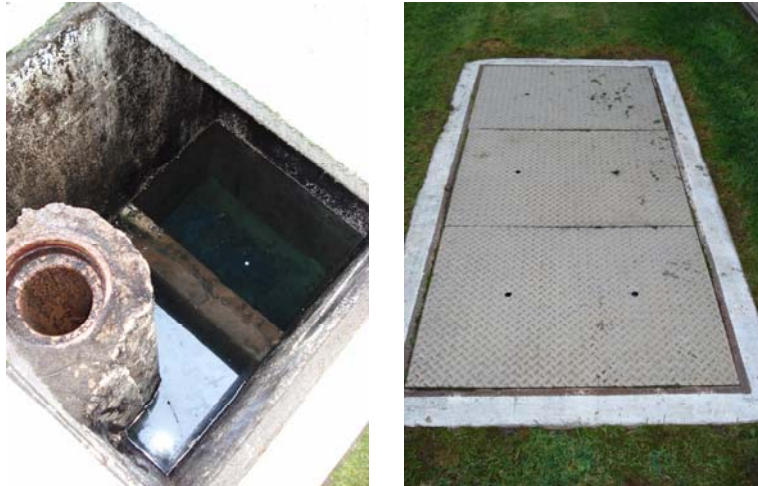
Photograph 22 and 23. – Storm water sump