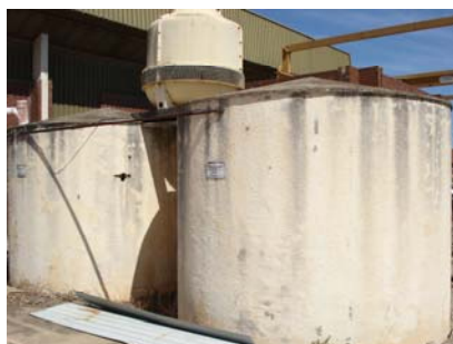
Photograph 17. Cement Water Tanks