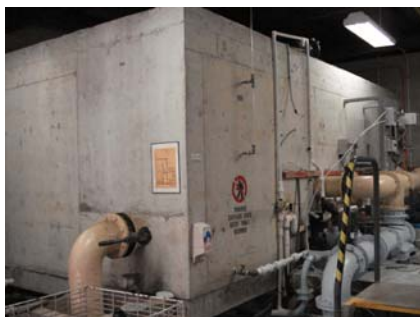
Photograph 4 – Enclosed Cement Sand Filter System