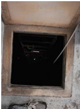
Photograph 1 – Sump 1