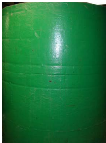
Photograph 12. Fibre Glass Water Tank