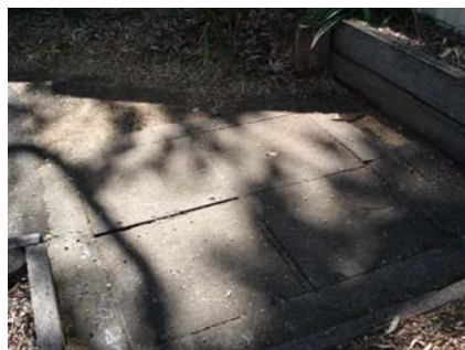
Photograph 7 – Quad Gatic Covered Sewer Pit