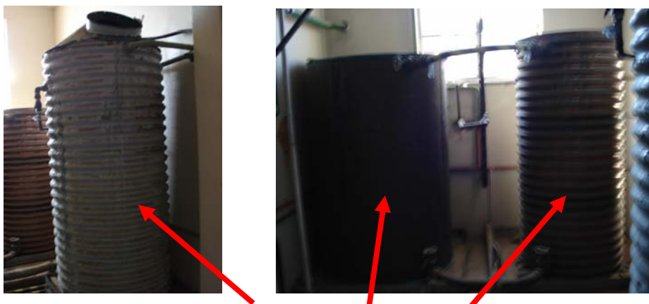
Photograph 20 & 21 - 3 Galvanised Water