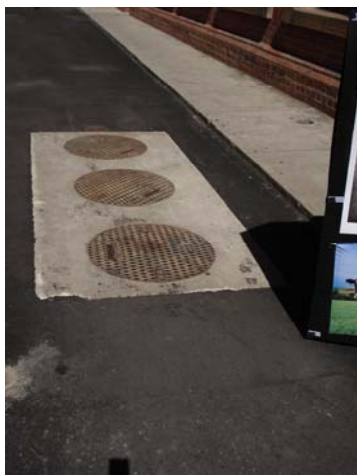
Photograph 12 Storm Water Gatic Covers