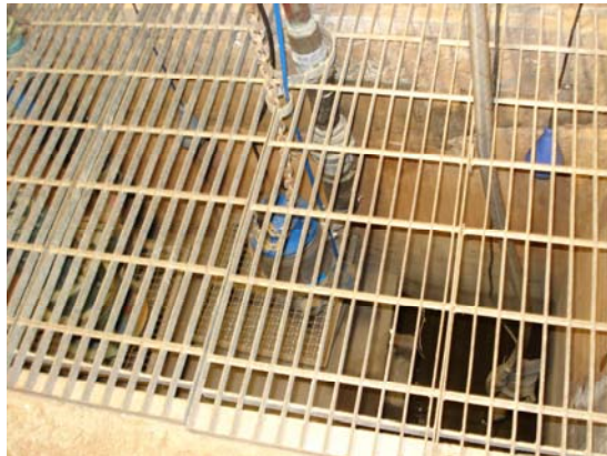
Photograph 25. –Tunnel Sumps