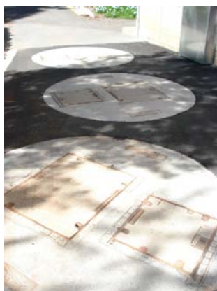
Photograph 3 – Sump and valve pits