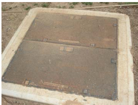
Photograph 4 – Gatic Cover