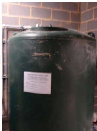
Photograph 22 - RO Water Tank