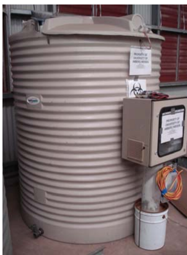
Photograph 9. Poly Tank