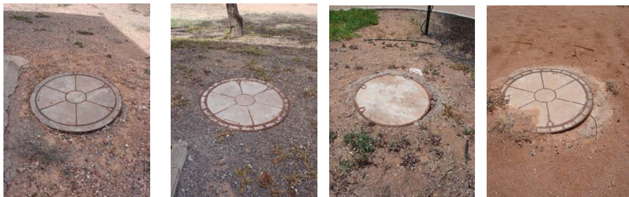
Photograph 2, 3, 4 and 5 – Sewer Gatic Covers