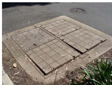
Photograph 5 – Quad Gatic Covered Sewer Pit