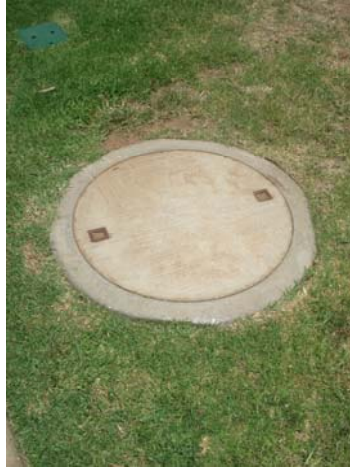
Photograph 2 – Gatic Cover