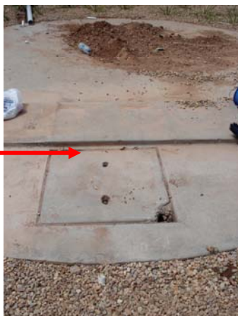
Photograph 1 – Underground Rain water Tank