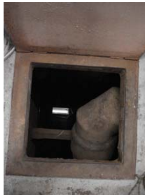
Photograph 2 – Sump 2