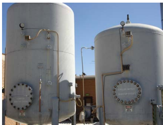
Photograph 2 Chilled and Hotwater Makeup