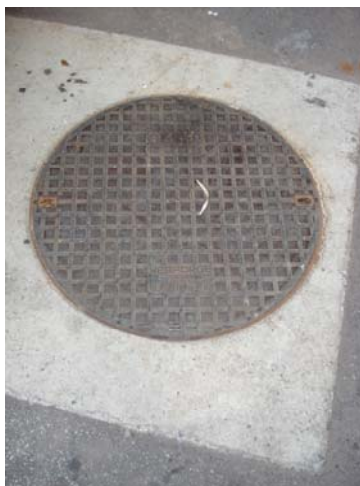
Photograph 24. – Sewer Gatic Cover