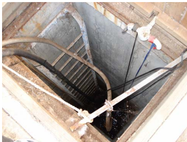
Photograph 15. Seepage Pit