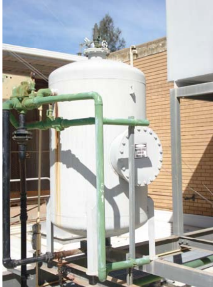
Photograph 4. Redundant Vessel