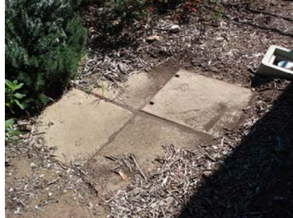
Photograph 6 – Quad Gatic Covered Sewer Pit