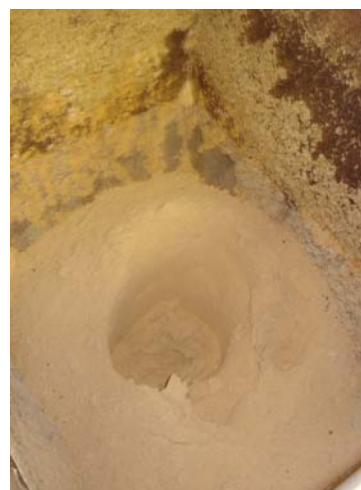
Photograph 10 & 11. Steel fabricated hoppers