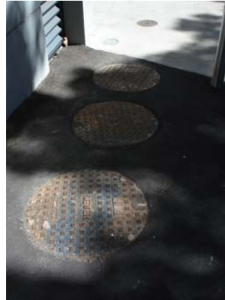
Photograph 8 – 3 Steel Sewer Gatic Covers