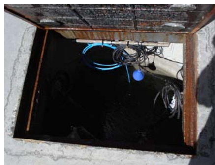
Photograph 4 – Opened Gatic