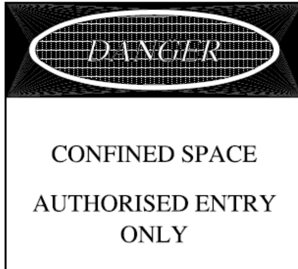
FIGURE 9 CONFINED SPACE ENTRY SIGN

Clause 10.61 Signs of HB213:2003, Page 37, further explains that signs should warn against entry by persons other than those authorized to enter a confined space. Employers may also wish to indicate on the signs that entry is permitted after signing the written authority for entry. An appropriate sign is shown below.