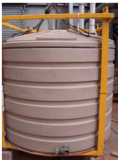
Photograph 8. Poly Tank