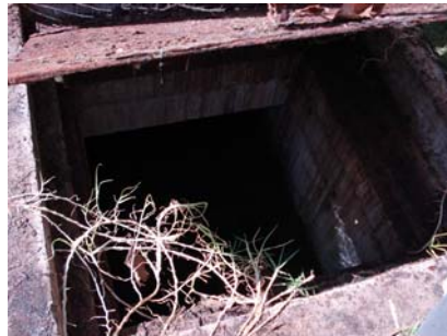
Photograph 1 – Opened hatch