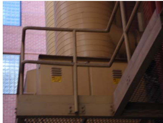
Photograph 17 - Air Conditioning Plant