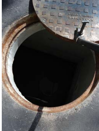
Photograph 7 – Open Sewer Gatic