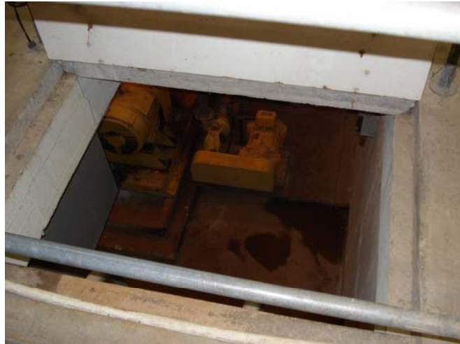
Photograph 13. Pump Room