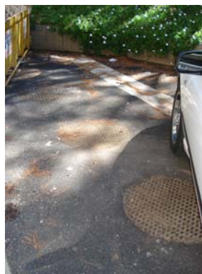
Photograph 6 – 3 Steel Gatic Cover