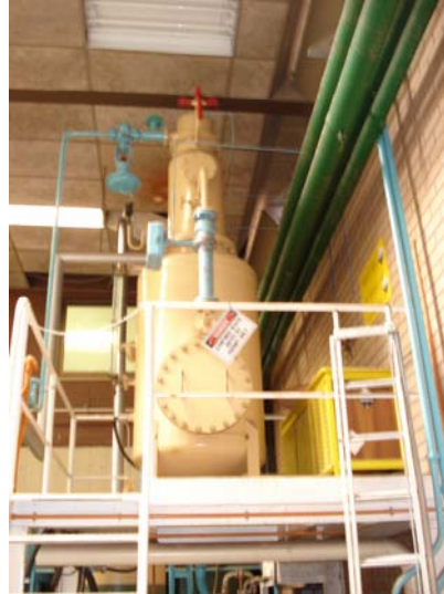
Photograph 5. Steam generator