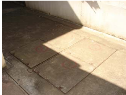
Photograph 8 – Quad Gatic Storm Water Pit