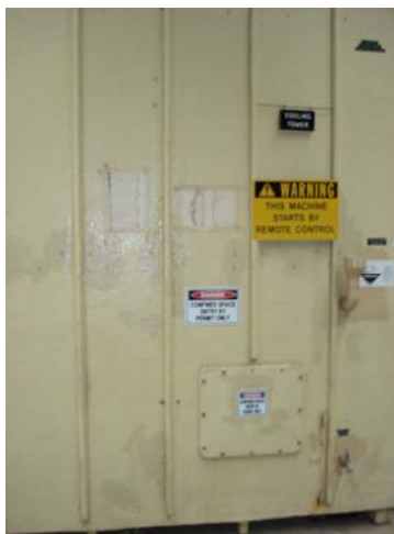
Photograph 7. Cooling Tower