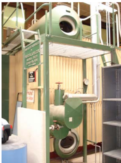
Photograph 6. Steam generator