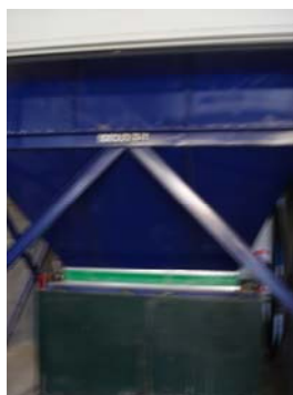
Photograph 4 – Dust Extraction Hopper and Collection Bin