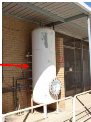
Photograph 1 – Pressure Vessel