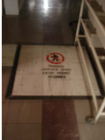
Photograph 16 - Corridor Gatic