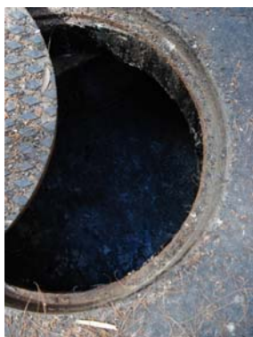
Photograph 5 – Open Gatic Cover