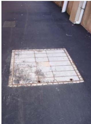
Photograph 18 - Acid Neutralising Pit