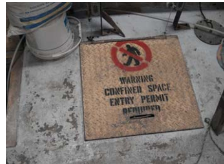
Photograph 3 – Sump 2 (Closed grate & stencil)