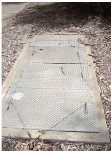
Photograph 20. – Acid Neutralising Pits