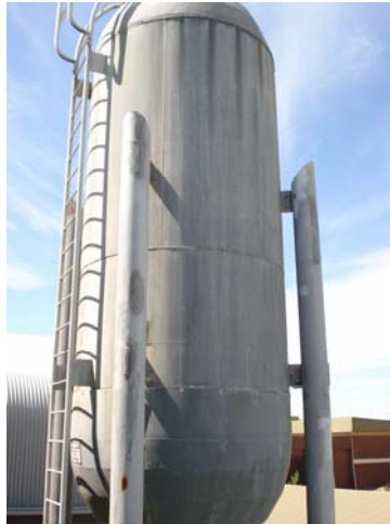
Photograph 14. Cylindrical Cone (Water Reticulation System)