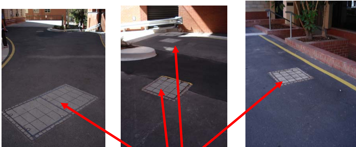
Photograph 13, 14, 15 - Storm Water Gatic