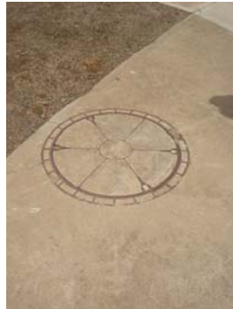
Photograph 1 – Gatic Cover