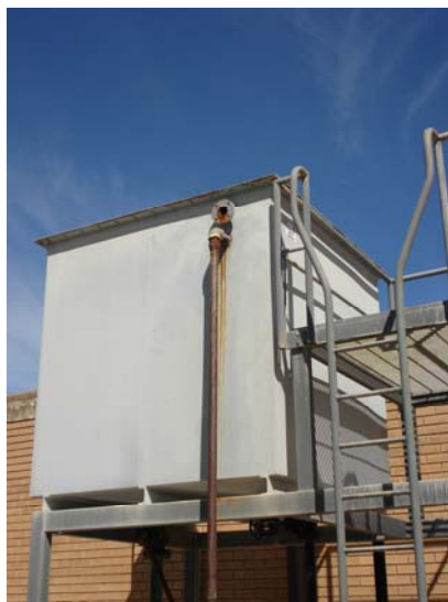
Photograph 3. Water Makeup Vessel