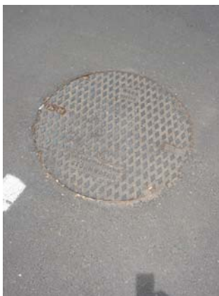
Photograph 3 – Gatic Cover