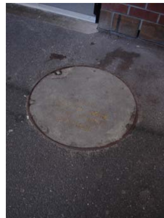
Photograph 10 & 11 Storm Water Gatic Covers