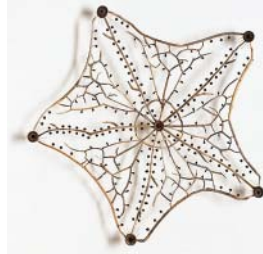
Shona Wilson Diatom No. 8, 2009

The Samstag Museum is delighted to present Abstract Nature which features the work of twenty renowned and accomplished artists, several of whom are South Australian and graduates of UniSA. The exhibition features works of art in a wide range of media inspired by the beauty of organic pattern and form in the