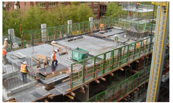
ABOVE: Construction photo of the new Health Sciences building on City East campus