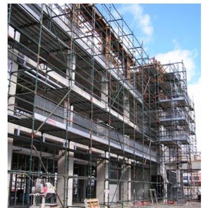
AT LEFT: Construction under way of the extension to the Sir Eric Neal Library, Mawson Lakes campus