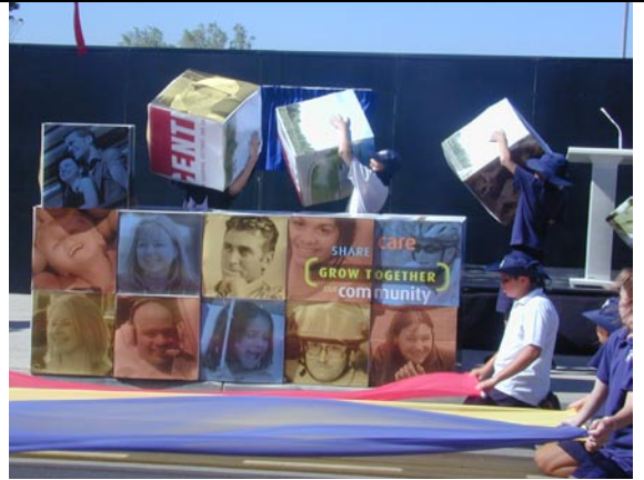
ABOVE: The performance by Mawson Lakes School students at the launch of the commencement of construction of The Mawson Centre

For more information on Blueprint 2005 and updated construction photographs, please visit our Blueprint website on: www.unisa.edu.au/blueprint