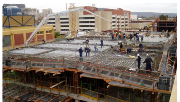
BELOW: The new Louis Laybourne Smith School of Architecture & Design and SA School of Art building, City West campus