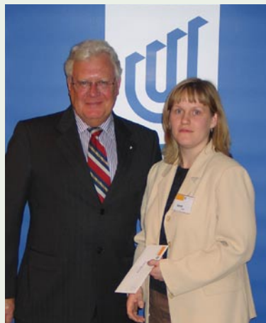
ABOVE LEFT: Recipient of the Nursing Agency of South Australia Transition Grant