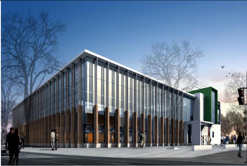
ABOVE: Artist's impression of The Mawson Centre, courtesy of Canberra MGT Architects and Russell & Yelland in association