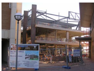
AT RIGHT: Building T taking shape at Mawson Lakes campus