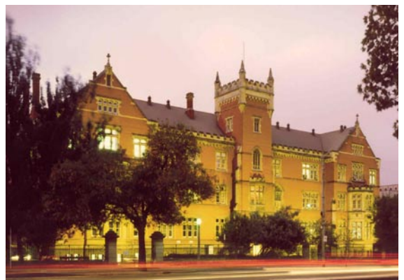
BELOW: Night shot of the historic Brookman Building

Graduates have excelled in business, medicine, science, education, philosophy, the church, the armed services, all levels of government, music, welfare, agriculture, and the public sector.