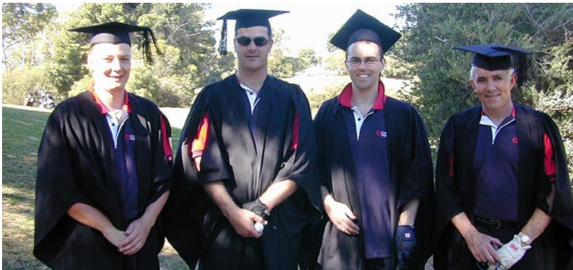
ABOVE: Winning Team – Corporate Express.

Venoms we may encounter in Australia, home to the most venomous creatures on the planet. We also have toxins in the environment! Experts will describe the different types of venoms and toxins and their effects.