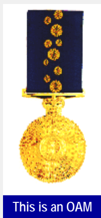
This is an OAM