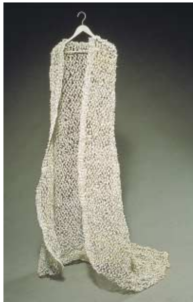
Christine COLLINS White Lies 1998 plastic soldiers, wire 250 x 150

Collins uses textile-like processes: repeated elements are linked together, setting up a relationship between the overall image and underlying pattern. Made out of electronic resistors hooked together, the chain-mail fabric of Dress turns down the volume of heavily didactic political comment in preference for a pun: electronic code/social code. This work indulges a sensual interaction between materials and the implied corporeal form of the body. The shimmering veil of Dress conjures the sensuality of material moving over form, the interaction of texture and shape.