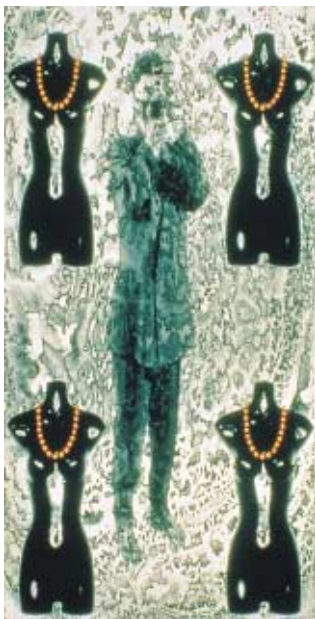
Rea EYE/I MMABLAKEPIECE 1996 cibachrome print 165 x 80

directions and describe two different feelings: “nice” and “nigger”, “mum” and “gin”. These new composite words are familiar yet strange. They resonate poetically and the formal play of the shapes of the yellow letters outlined in white against a black background holds our attention while we struggle with recognition, and ponder meaning.