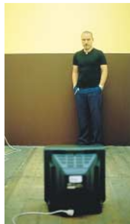
John SPITERI Police Line-up 1999 installation of video, acrylic paint on wall 165 x 80