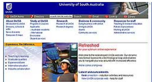
UniSA's cyber presence gets a makeover