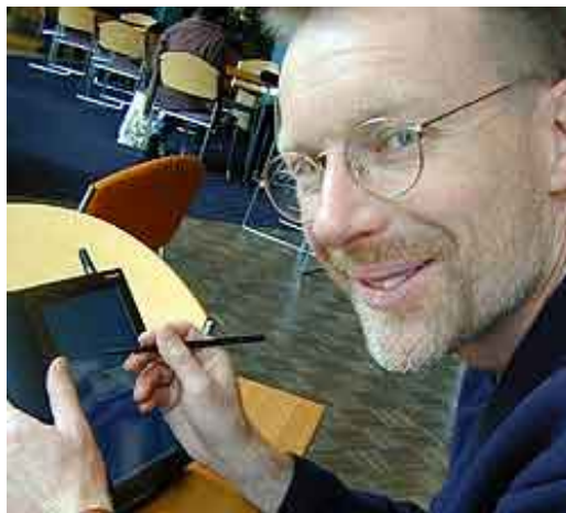
The onset of e-books

UniSA researchers have scored a major contract to improve the way in which heavy metal contaminated sites are cleaned up in Korea.